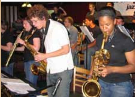
Top: Corridor Jazz Project at Prairie High School