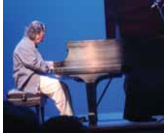
Pianist Chick Corea performed at the Englert in April 2010.

And a review of the year wouldn't be complete without noting the passing of a handful of significant jazz legends. That list included guitarist Herb Ellis, a member of the great Oscar Peterson Trio of the 1950s; singer Abbey Lincoln who, with her husband drummer Max Roach, was a strong voice in the American civil rights movement of the '60s; pianist Hank Jones, the last surviving member of the great Jones Brothers of Detroit which included trumpeter and bandleader Thad and drummer Elvin; saxophonist/flutist James Moody, an institution in jazz from the late '40s into the 21st Century who was active right up until the end releasing his final CD in the fall at age 85; and Dr. Billy Taylor, who was not only one of the premiere pianists and composers of the genre, but was also a tireless and articulate spokesman for the music, from his creation of the Jazzmobile in the 1960s which introduced jazz to the neighborhoods and boroughs of New York, to his founding and directing of the popular public radio program "Jazz Alive," to his profiles on CBS' "Sunday Morning" television program, which were so successful in introducing jazz to a wider audience.