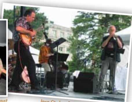
Iowa City Jazz Festival