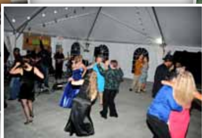
Over 100 couples danced the night away at KCCK's "Hot August Nights - Prom" at Cedar Ridge Winery.