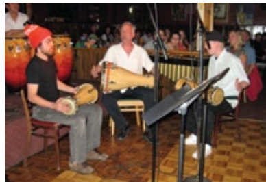
Jazz at the Mill

In 2010, we look forward to more opportunities to bring jazz to your neighborhood and music to your life!