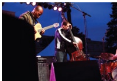
Iowa City Jazz Festival